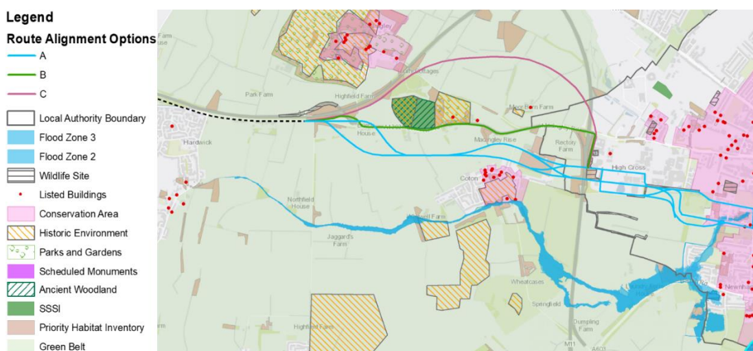
Figure 1 - Options for A428 alignment

It was concluded that the currently proposed corridor (Option A) was the most attractive in terms of programme, planning and environmental constraints, as well as journey time, subject to addressing the areas of concern set out above.