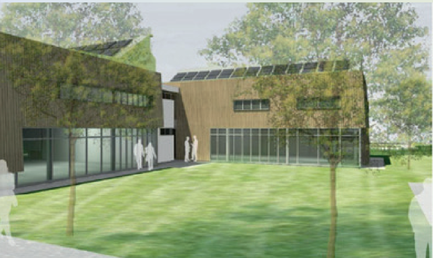
Littleport Eco Park - artist's impression.

Doubling the size of the Littleport economy to £286m over 25 years will require further intervention to create additional employment and housing growth. This can be delivered as part of improvements to the town centre and creation of a station gateway. Options for both these areas will be reported in a future update to the Littleport Vision, once feasibility work has been completed.